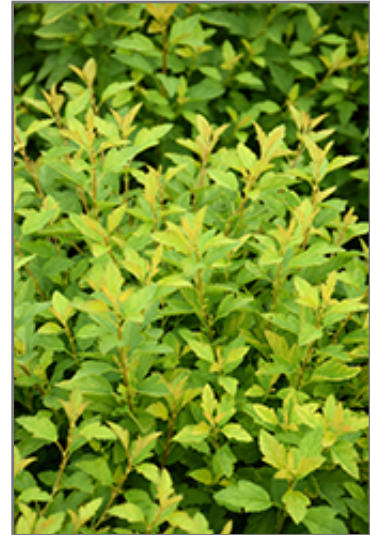
Raspberry Lemonade Ninebark foliage

Raspberry Lemonade Ninebark is recommended for the following landscape applications;