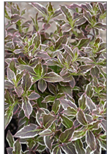
My Monet Purple Effect Weigela foliage