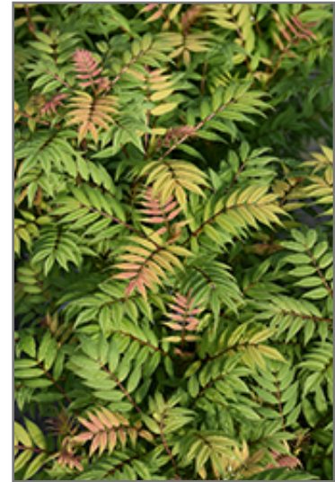
Mr. Mustard False Spirea foliage