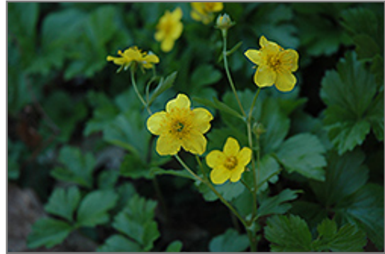
Barren Strawberry flowers