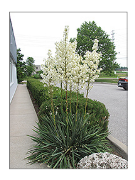
Adam's Needle in bloom