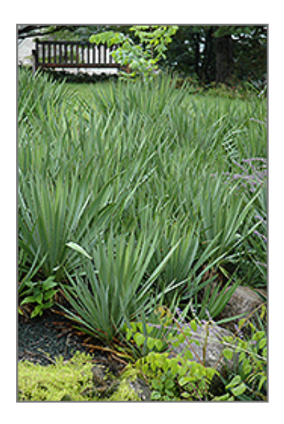
Adam's Needle