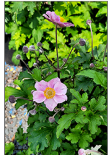
Pink Saucer Anemone flowers

Pink Saucer Anemone is recommended for the following landscape applications;