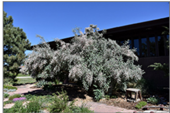
Blue Velvet Honeysuckle in bloom