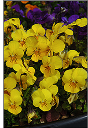
Penny Yellow Pansy flowers