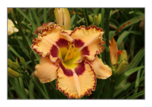
Rainbow Rhythm Lake of Fire Daylily flowers