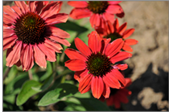
Color Coded Frankly Scarlet Coneflower flowers

Color Coded Frankly Scarlet Coneflower is a fine choice for the garden, but it is also a good selection for planting in outdoor pots and containers. With its upright habit of growth, it is best suited for use as a 'thriller' in the 'spiller-thriller-filler' container combination; plant it near the center of the pot, surrounded by smaller plants and those that spill over the edges. It is even sizeable enough that it can be grown alone in a suitable container. Note that when growing plants in outdoor containers and baskets, they may require more frequent waterings than they would in the yard or garden.