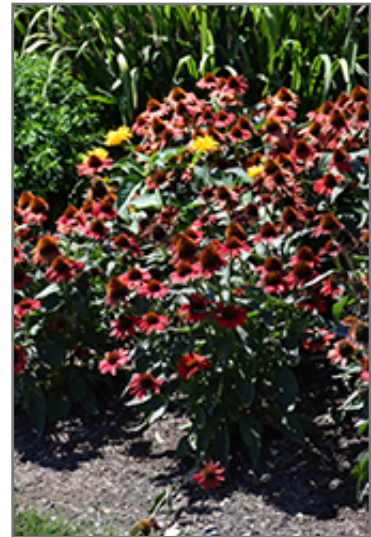
Color Coded Frankly Scarlet Coneflower in bloom