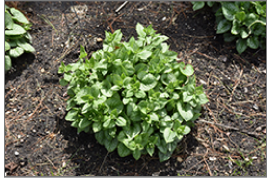
Jack of Diamonds Bugloss

Jack of Diamonds Bugloss will grow to be about 14 inches tall at maturity, with a spread of 30 inches. When grown in masses or used as a bedding plant, individual plants should be spaced approximately 28 inches apart. It grows at a medium rate, and under ideal conditions can be expected to live for approximately 10 years. As an herbaceous perennial, this plant will usually die back to the crown each winter, and will regrow from the base each spring. Be careful not to disturb the crown in late winter when it may not be readily seen!