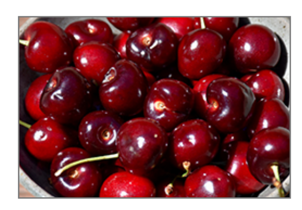
Lambert Cherry fruit

A very productive variety, with showy white flowers in spring followed by heavy crops of large, sweet red cherries that are especially good for cooking; needs full sun, well drained soil and a pollinator; be prepared to fight the birds for fruit