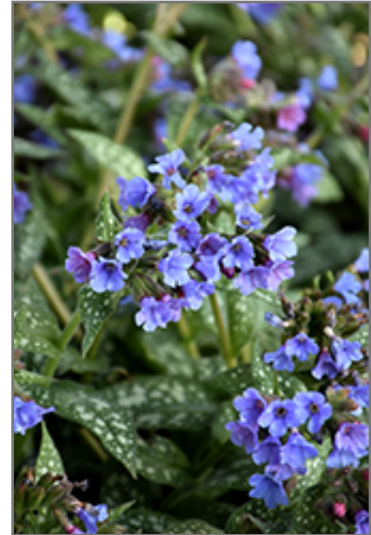
Trevi Fountain Lungwort flowers