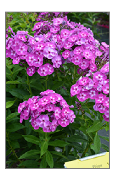
Laura Garden Phlox flowers

Laura Garden Phlox features bold fragrant conical lilac purple star-shaped flowers with white eyes at the ends of the stems from early summer to early fall. The flowers are excellent for cutting. Its narrow leaves remain green in color throughout the season.