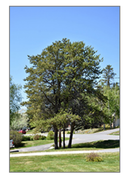
Jack Pine

Jack Pine will grow to be about 45 feet tall at maturity, with a spread of 35 feet. It has a low canopy with a typical clearance of 4 feet from the ground, and should not be planted underneath power lines. It grows at a slow rate, and under ideal conditions can be expected to live for 80 years or more.