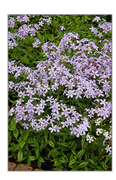
Woodland Phlox flowers

Woodland Phlox will grow to be about 8 inches tall at maturity, with a spread of 18 inches. When grown in masses or used as a bedding plant, individual plants should be spaced approximately 16 inches apart. Its foliage tends to remain low and dense right to the ground. It grows at a medium rate, and under ideal conditions can be expected to live for approximately 10 years. As an herbaceous perennial, this plant will usually die back to the crown each winter, and will regrow from the base each spring. Be careful not to disturb the crown in late winter when it may not be readily seen!