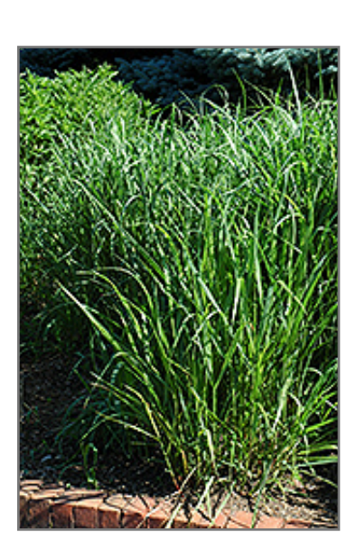
Switch Grass

Switch Grass is an herbaceous perennial grass with an upright spreading habit of growth. Its relatively fine texture sets it apart from other garden plants with less refined foliage.