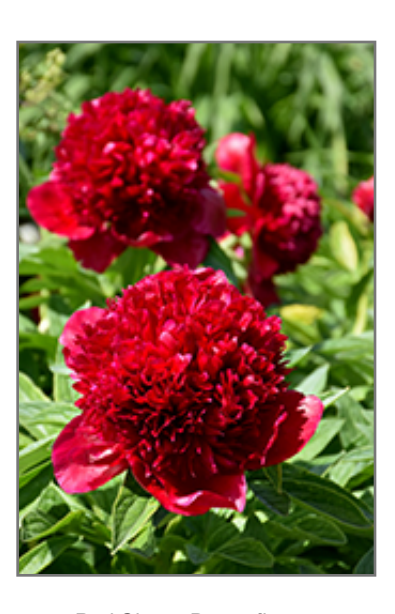
Red Charm Peony flowers

Red Charm Peony will grow to be about 30 inches tall at maturity, with a spread of 3 feet. When grown in masses or used as a bedding plant, individual plants should be spaced approximately 30 inches apart. The flower stalks can be weak and so it may require staking in exposed sites or excessively rich soils. It grows at a slow rate, and under ideal conditions can be expected to live for approximately 20 years. As an herbaceous perennial, this plant will usually die back to the crown each winter, and will regrow from the base each spring. Be careful not to disturb the crown in late winter when it may not be readily seen!