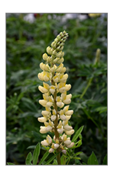
Chandelier Lupine flowers

A vivid, gorgeous selection, producing thick spikes of eye catching blooms in shades of yellow and cream; a tremendous visual impact massed in the garden, border plantings or in containers