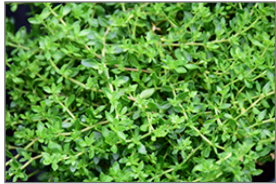
Rupturewort foliage

Rupturewort is recommended for the following landscape applications;