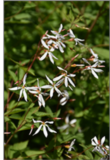
Bowman's Root flowers

This plant will require occasional maintenance and upkeep, and should be cut back in late fall in preparation for winter. It is a good choice for attracting bees and butterflies to your yard. It has no significant negative characteristics.