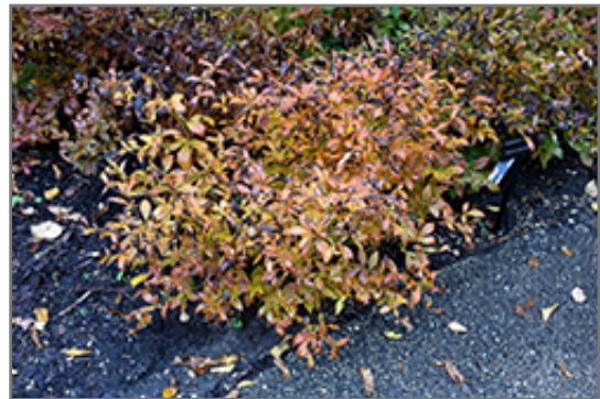
Bowman's Root in fall