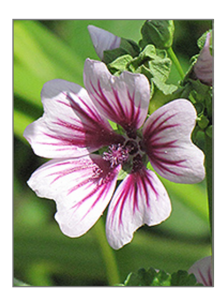
Zebrina Mallow flowers