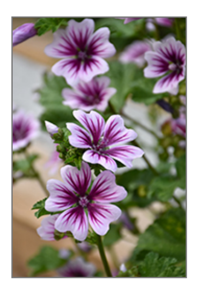
Zebrina Mallow flowers