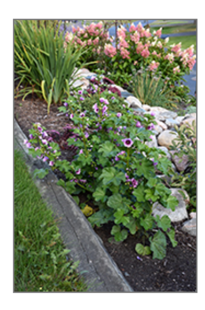
Zebrina Mallow in bloom