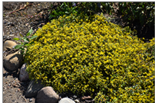
Rock 'N Low Yellow Brick Road Stonecrop in bloom