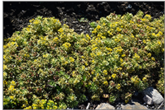
Rock 'N Low Boogie Woogie Stonecrop in bloom