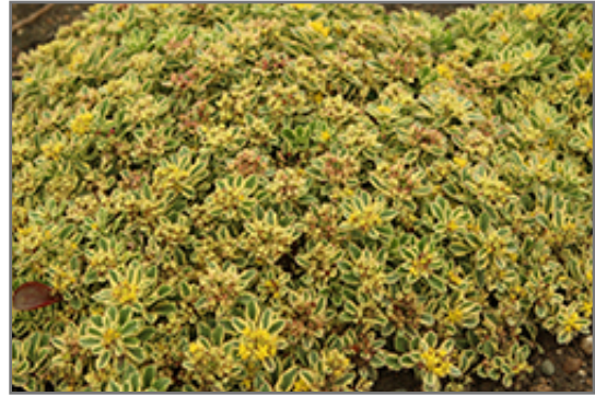
Rock 'N Low Boogie Woogie Stonecrop flowers

Rock 'N Low Boogie Woogie Stonecrop is a dense herbaceous perennial with a mounded form. Its medium texture blends into the garden, but can always be balanced by a couple of finer or coarser plants for an effective composition.