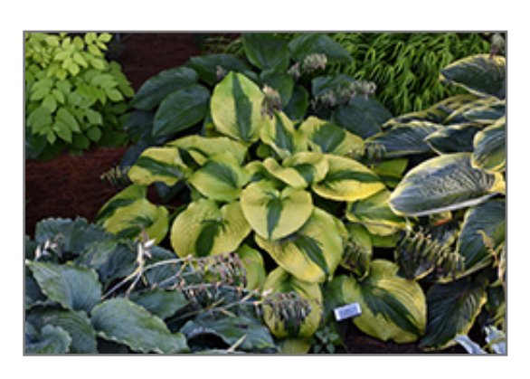
Afterglow Hosta