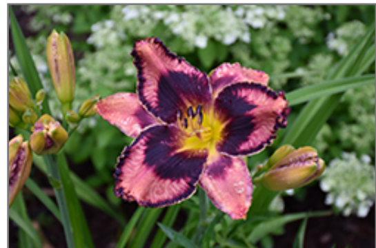
Rainbow Rhythm Storm Shelter Daylily flowers