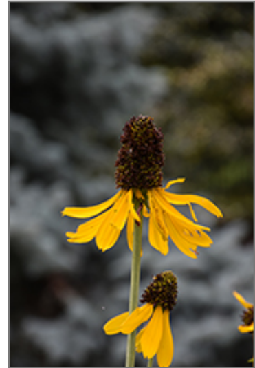
Giant Coneflower flowers

* This is a 'special order' plant - contact store for details