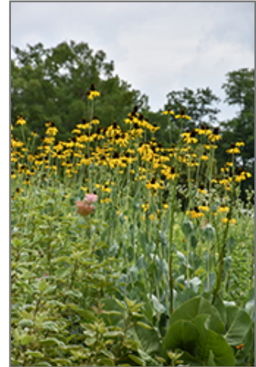
Giant Coneflower in bloom

Giant Coneflower is recommended for the following landscape applications;