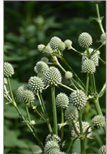
Rattlesnake Master flowers

Rattlesnake Master is recommended for the following landscape applications;