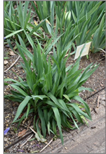
Rattlesnake Master

Rattlesnake Master is a fine choice for the garden, but it is also a good selection for planting in outdoor pots and containers. Because of its height, it is often used as a 'thriller' in the 'spiller-thriller-filler' container combination; plant it near the center of the pot, surrounded by smaller plants and those that spill over the edges. It is even sizeable enough that it can be grown alone in a suitable container. Note that when growing plants in outdoor containers and baskets, they may require more frequent waterings than they would in the yard or garden.