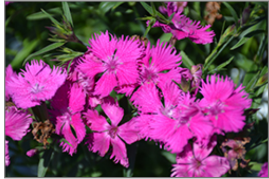
Rockin' Purple Pinks flowers

This is a relatively low maintenance plant, and is best cleaned up in early spring before it resumes active growth for the season. It is a good choice for attracting bees and butterflies to your yard, but is not particularly attractive to deer who tend to leave it alone in favor of tastier treats. It has no significant negative characteristics.