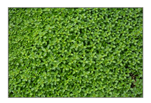
Creeping Thyme foliage

Creeping Thyme is recommended for the following landscape applications;