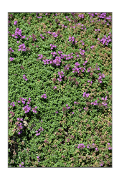
Creeping Thyme in bloom

This is a relatively low maintenance plant, and is best cleaned up in early spring before it resumes active growth for the season. Deer don't particularly care for this plant and will usually leave it alone in favor of tastier treats. It has no significant negative characteristics.