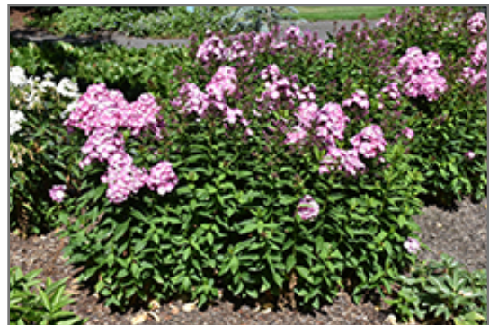
Volcano Pink with White Eye Garden Phlox in bloom