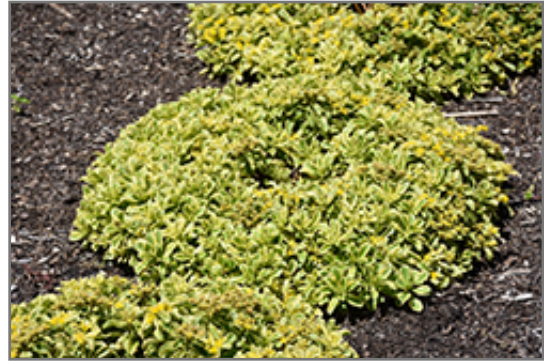
Cutting Edge Stonecrop

Cutting Edge Stonecrop will grow to be only 6 inches tall at maturity, with a spread of 16 inches. When grown in masses or used as a bedding plant, individual plants should be spaced approximately 12 inches apart. Its foliage tends to remain low and dense right to the ground. It grows at a fast rate, and under ideal conditions can be expected to live for approximately 15 years. As an herbaceous perennial, this plant will usually die back to the crown each winter, and will regrow from the base each spring. Be careful not to disturb the crown in late winter when it may not be readily seen!