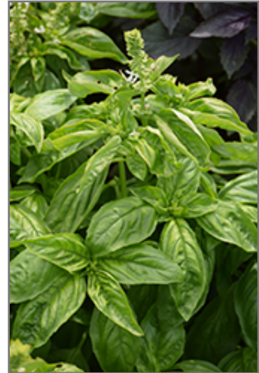
Genovese Basil foliage

Genovese Basil will grow to be about 20 inches tall at maturity, with a spread of 14 inches. When grown in masses or used as a bedding plant, individual plants should be spaced approximately 12 inches apart. This fast-growing annual will normally live for one full growing season, needing replacement the following year.