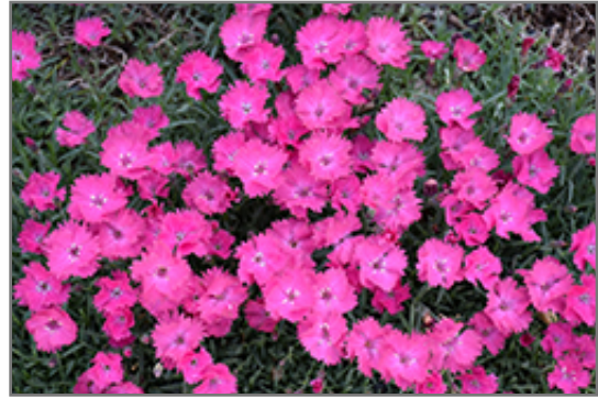
Vivid Bright Light Pinks flowers

Vivid Bright Light Pinks is recommended for the following landscape applications;