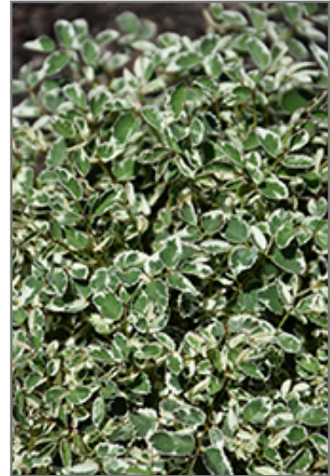
Little Angel Burnet flowers

Little Angel Burnet will grow to be only 4 inches tall at maturity extending to 10 inches tall with the flowers, with a spread of 14 inches. When grown in masses or used as a bedding plant, individual plants should be spaced approximately 12 inches apart. It grows at a medium rate, and under ideal conditions can be expected to live for approximately 15 years. As an herbaceous perennial, this plant will usually die back to the crown each winter, and will regrow from the base each spring. Be careful not to disturb the crown in late winter when it may not be readily seen!