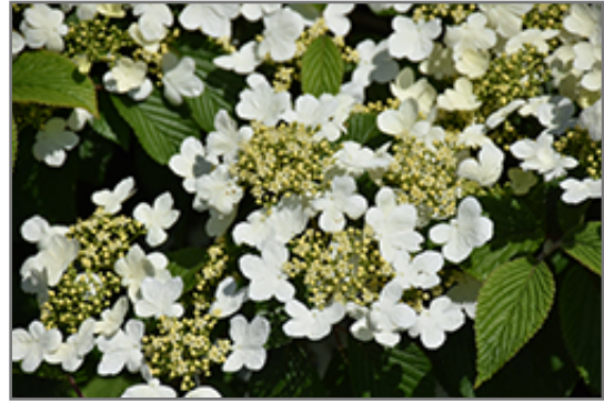
Wabi Sabi Doublefile Viburnum flowers

Wabi Sabi Doublefile Viburnum is a multi-stemmed deciduous shrub with a stunning habit of growth which features almost oriental horizontally-tiered branches. Its average texture blends into the landscape, but can be balanced by one or two finer or coarser trees or shrubs for an effective composition.