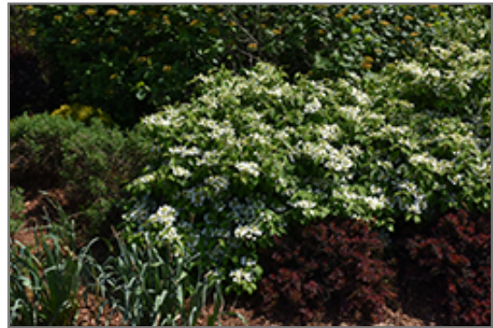
Wabi Sabi Doublefile Viburnum in bloom