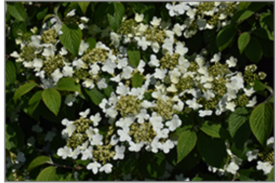
Wabi Sabi Doublefile Viburnum flowers