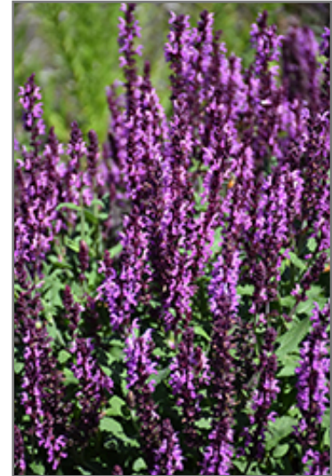
Pink Profusion Meadow Sage flowers

Pink Profusion Meadow Sage is recommended for the following landscape applications;