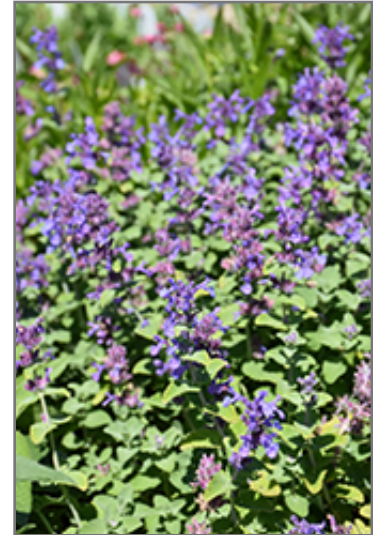
Early Bird Catmint flowers

Early Bird Catmint is recommended for the following landscape applications;