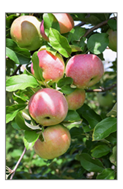
Northern Spy Apple fruit