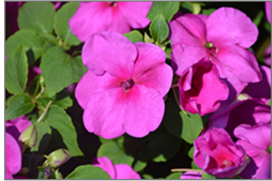
Accent Premium Lilac Impatiens flowers