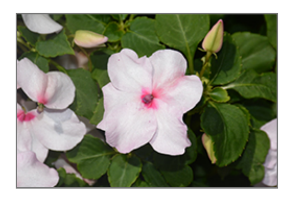
Accent Premium Bright Eye Impatiens flowers