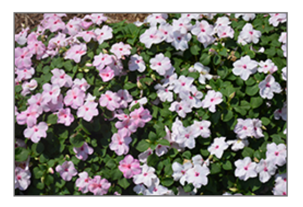
Accent Premium Bright Eye Impatiens flowers