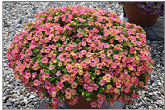
Chameleon Sunshine Berry Calibrachoa in bloom