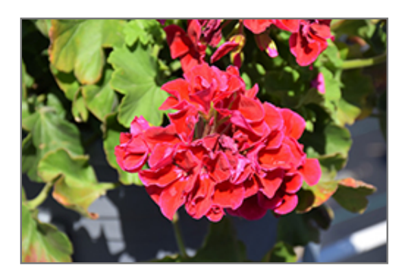
Calliope Medium Crimson Flame Geranium flowers