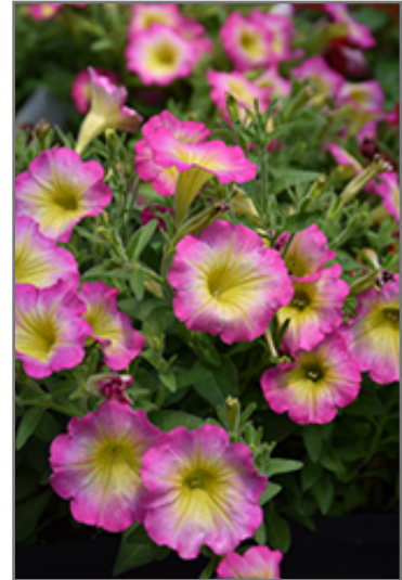
Supertunia Daybreak Charm Petunia flowers

Supertunia Daybreak Charm Petunia is a dense herbaceous annual with a trailing habit of growth, eventually spilling over the edges of hanging baskets and containers. Its medium texture blends into the garden, but can always be balanced by a couple of finer or coarser plants for an effective composition.