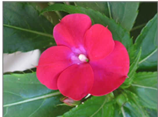
Infinity Cherry Red New Guinea Impatiens flowers