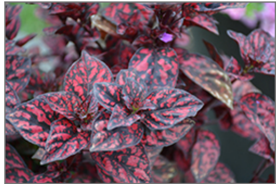
Hippo Red Polka Dot Plant foliage

Hippo Red Polka Dot Plant is recommended for the following landscape applications;