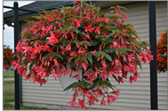
Bossa Nova Pink Glow Begonia in bloom

Bossa Nova Pink Glow Begonia is a fine choice for the garden, but it is also a good selection for planting in outdoor containers and hanging baskets. Because of its trailing habit of growth, it is ideally suited for use as a 'spiller' in the 'spiller-thriller-filler' container combination; plant it near the edges where it can spill gracefully over the pot. Note that when growing plants in outdoor containers and baskets, they may require more frequent waterings than they would in the yard or garden.