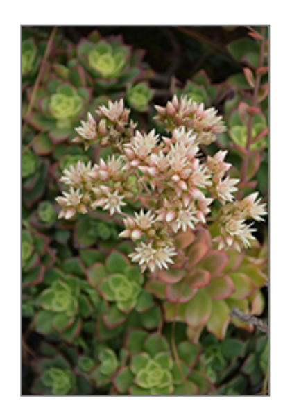
Kiwi Aeonium flowers