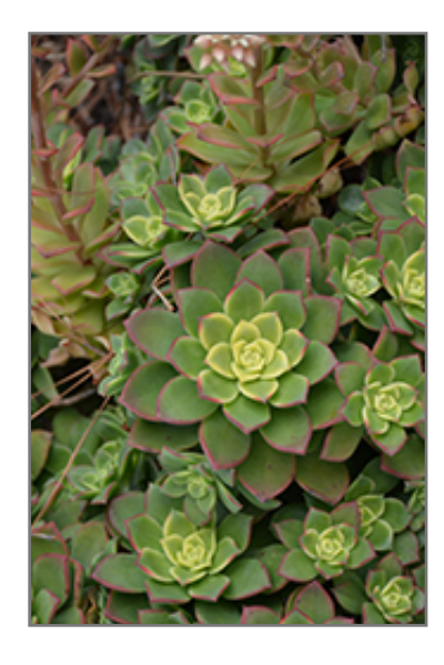
Kiwi Aeonium foliage

Kiwi Aeonium is a fine choice for the garden, but it is also a good selection for planting in outdoor pots and containers. Because of its spreading habit of growth, it is ideally suited for use as a 'spiller' in the 'spiller-thriller-filler' container combination; plant it near the edges where it can spill gracefully over the pot. Note that when growing plants in outdoor containers and baskets, they may require more frequent waterings than they would in the yard or garden.