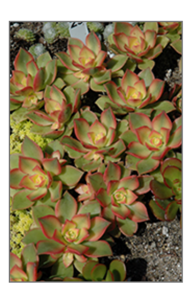
Kiwi Aeonium