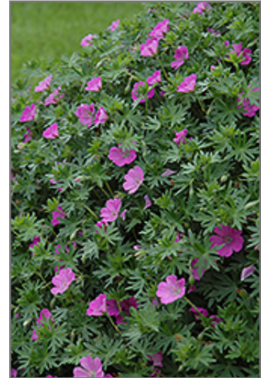
Bloody Cranesbill flowers