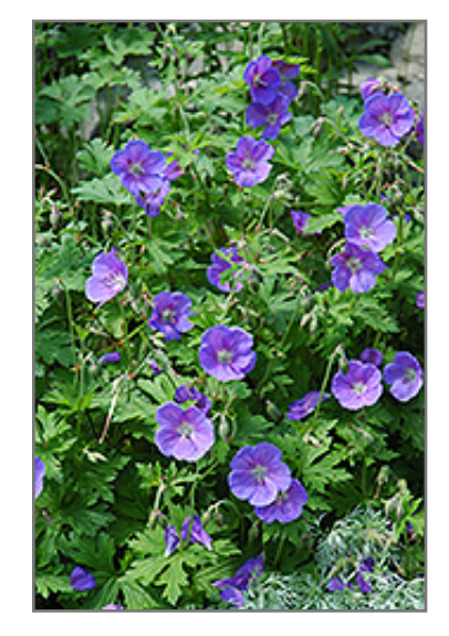
Johnson's Blue Cranesbill flowers

This is a relatively low maintenance plant, and should only be pruned after flowering to avoid removing any of the current season's flowers. Deer don't particularly care for this plant and will usually leave it alone in favor of tastier treats. It has no significant negative characteristics.