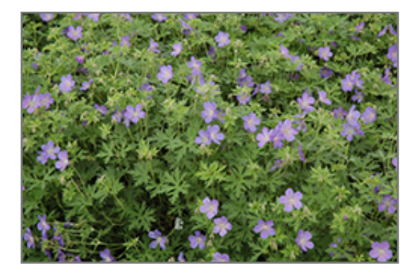
Johnson's Blue Cranesbill in bloom

Johnson's Blue Cranesbill is recommended for the following landscape applications;